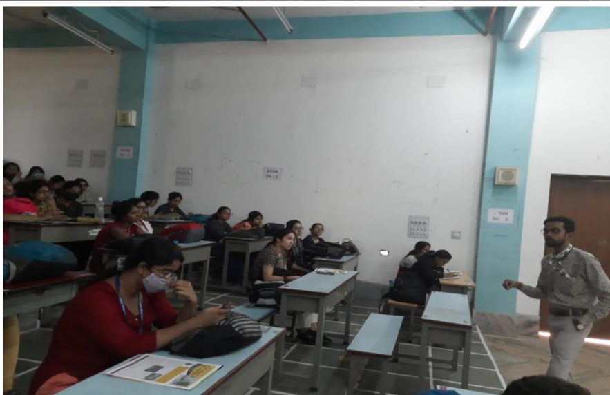
Students attending a Career Counselling session